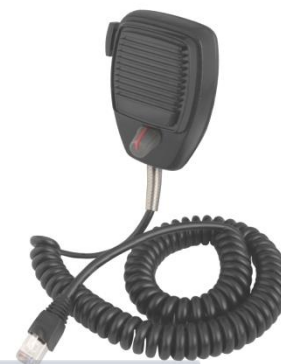
MICROPHONE in OPTION

Full Electronic Air Horn Emulator Ideatec CAN / CANopen / CIA447 / SAEJ1939 Compatible. Park kill integrated Input polarity protection Fully electronically protected against failure (Overload, Short-circuit) with monitoring Overload Protected Openload Speaker Detection (available on Canbus) 4 Configurable inputs Ignition Position Management 1 Positive Status output (1,5A)